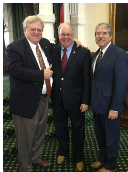
Senator Bettencourt (left) and Senator Taylor (right) pictured with Rep. Shine after approving disaster relief bill.

HB 492 and HJR 34 was the product of over 18 months of hard work between stakeholders and members of the legislature. The legislation will create a mandatory property tax exemption due to a natural disaster declared by the Governor in all taxing entities until they adopt their tax rate. If the natural disaster occurs after the tax rate is set then it is a local option as to if the taxing jurisdiction adopts the tax exemption. This will help any storms or disasters in the future that leave people's lives in ruins. Thank you to Senator Bettencourt and Taylor for sponsoring this language in the Senate. I am proud to have authored this important legislation!